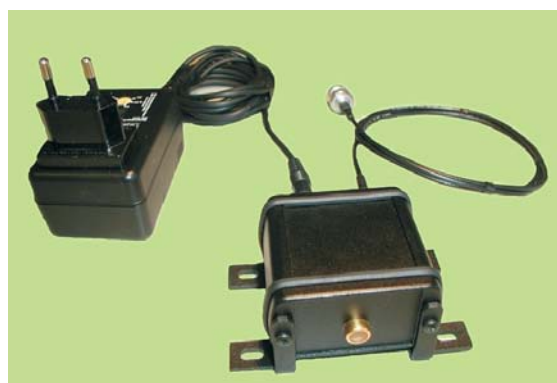
Fig. 1: Photomicrograph of the id Quantique's id100-20.

Ch. de la Marbrerie, 3 1227 Carouge Switzerland Tel: +41 (0)22 301 83 71 Fax: +41 (0)22 301 83 79 sales@idquantique.com www.idquantique.com