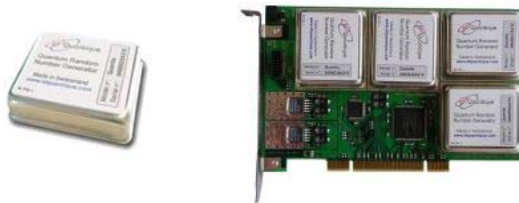
Fig. 2. Quantis: OEM and PCI, cf. [31]

A spin-off company from the University of Geneva, id Quantique , [30], markets a quantum mechanical random number generator called Quantis , see Fig. 2. Quantis is available as an OEM component which can be mounted on a plastic circuit board or as a PCI card; it can supply a (theoretically, arbitrarily) long string of quantum random bits sufficiently fast for cryptographic applications. 5